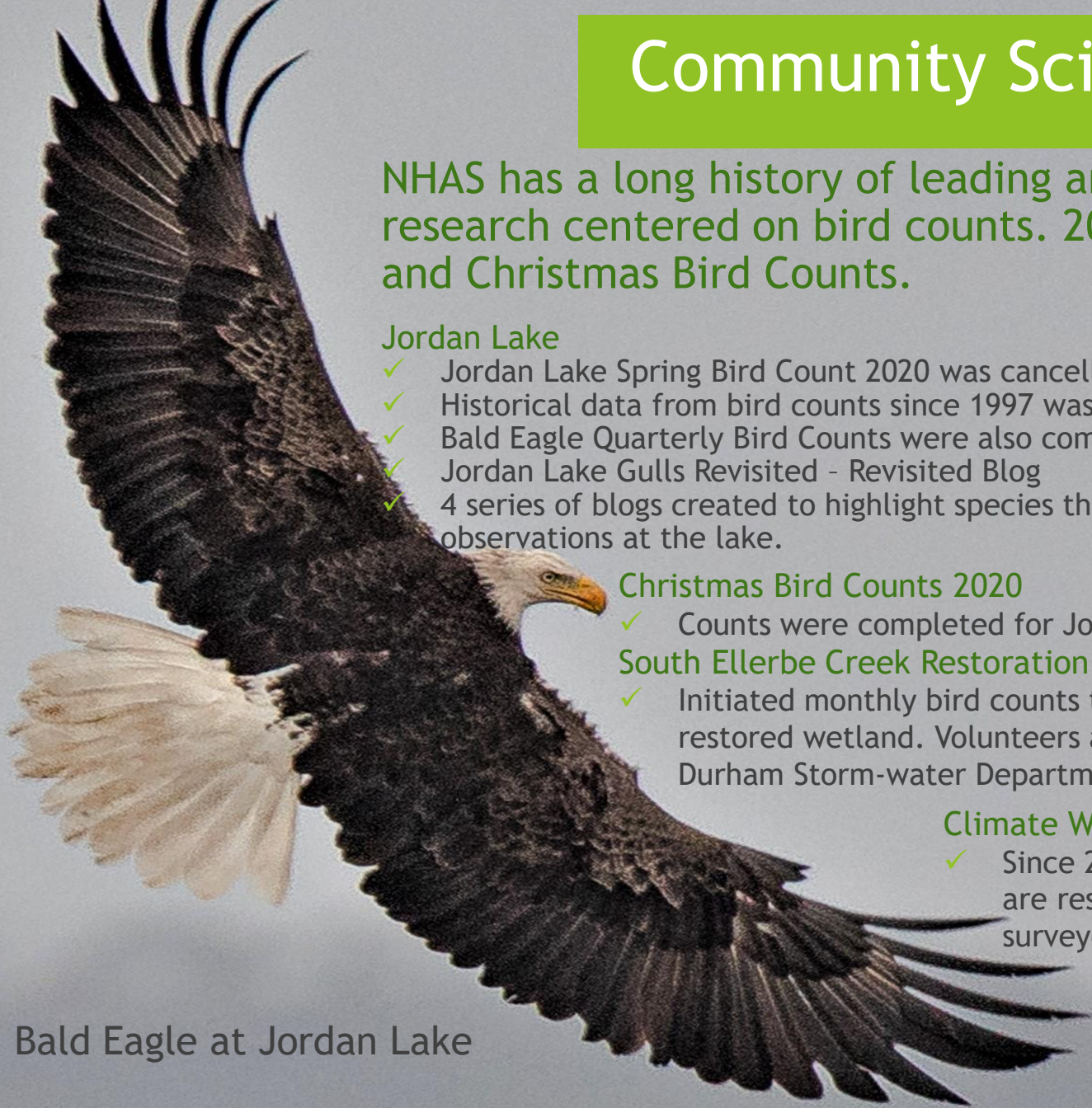
Bald Eagle at Jordan Lake