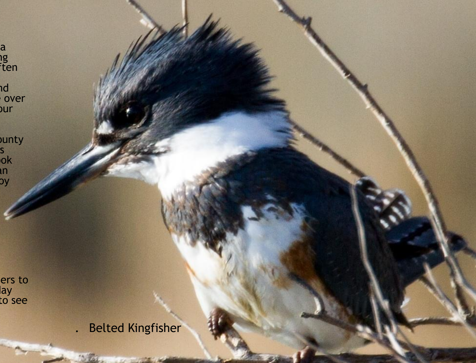
. Belted Kingfisher

Annual trips are part of our educational programming and January 2020 allowed local birders to travel to the coast. The three-day trip gave birders opportunities to see over 85 species of birds.